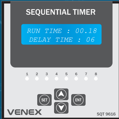
16X2 LCD Display